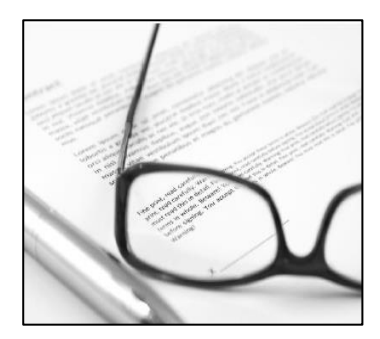
Landmark case the seeded the Corporate world