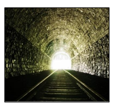
Earnings Per Share