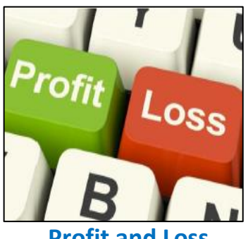
Profit and Loss