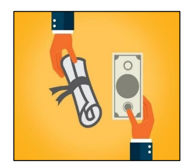
Buy-Back of shares